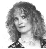
Chelydra Newport News, VA

Routines are limited to seven minutes (but remember, less is sometimes more). Music must be on CD-R (not CD-RW). MP3 format is NOT supported.